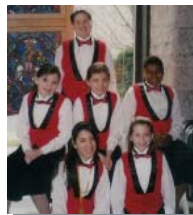
Pennsylvania Youth Chorale Sunday, March 18 - 3:00 p.m.